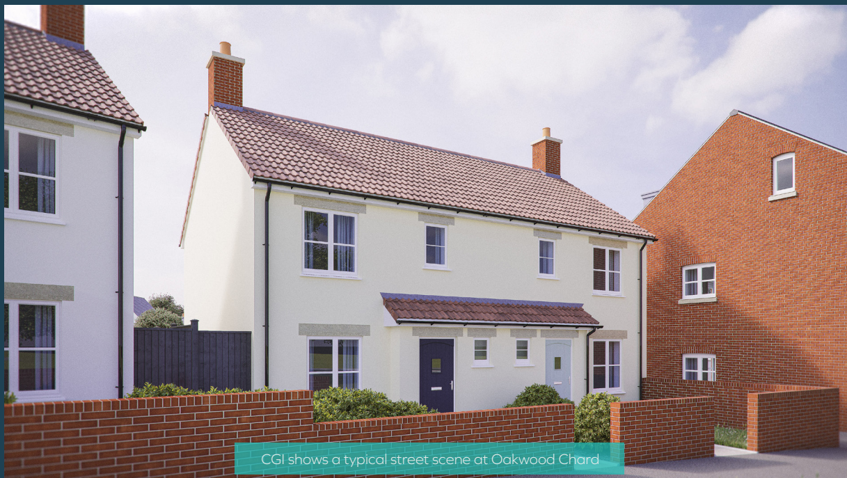
CGI shows a typical street scene at Oakwood Chard